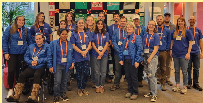
ACC's Horticulture Technology student team at the National Collegiate Landscape Competition at NC State University.