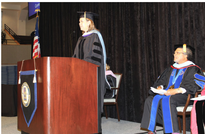
NC State Senator Amy Gale delivered the commencement keynote address.