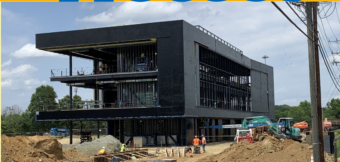
Construction is moving fast on ACC's Biotechnology Center of Excellence at Exit 150 on I-85/40.