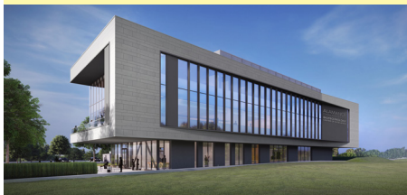
Architectural rendering of the Biotechnology Center of Excellence currently under construction.