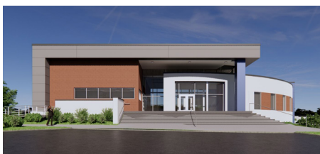
Architectural rendering of the Student Services Center.