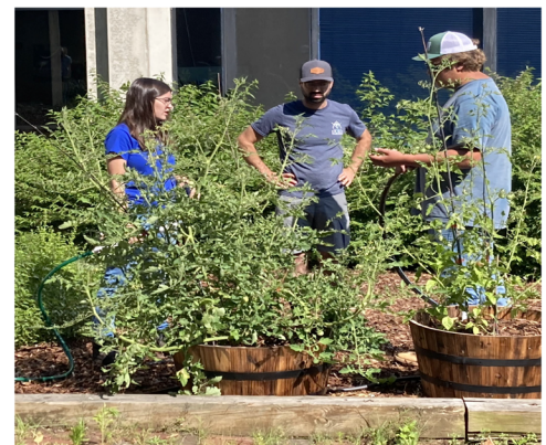
ACC students working in garden

During the Spring Fling, volunteer students served pizza to 104 students as well as provided 168 students with plants, planting instructions, and recipes enabling students to make pizza over the summer while away from campus. Thanks donors for helping us provide innovative grants.