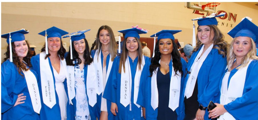
Dental Assisting graduates celebrated earning their credentials.

ACC held its first in-person commencement exercises in two years on June 3, providing 818 graduates of curriculum and GED/ Adult High School programs the opportunity to celebrate with family and friends at the ceremony held on the Elon University campus. Due to the Covid-19 pandemic, commencement was held virtually in 2020 and 2021.