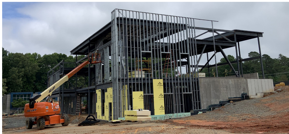
Construction on the Student Services Center is past the midway point toward an early 2023 opening.

Slated to open in late fall 2022, the Student Services Center is a 12,203 square foot, $6.7 million facility that will relocate and enhance space for Admissions, Registrar's Office, Financial Aid, Student Payments, and the Office of the Vice President for Student Success. Upon completion, it will serve as the new entrance to the campus core facing Jimmie Kerr Road.